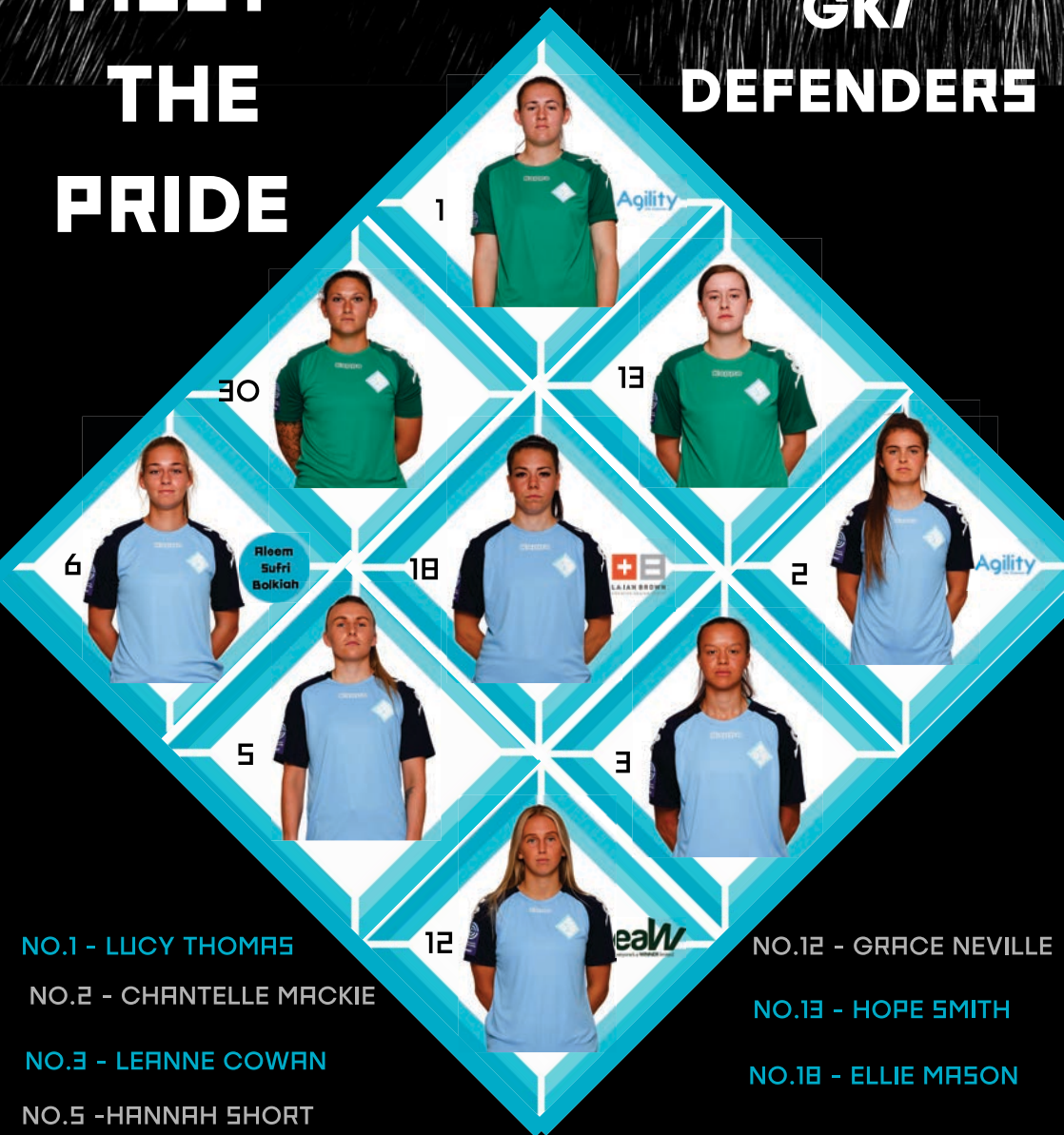
NO.1 - LUCY THOMAS